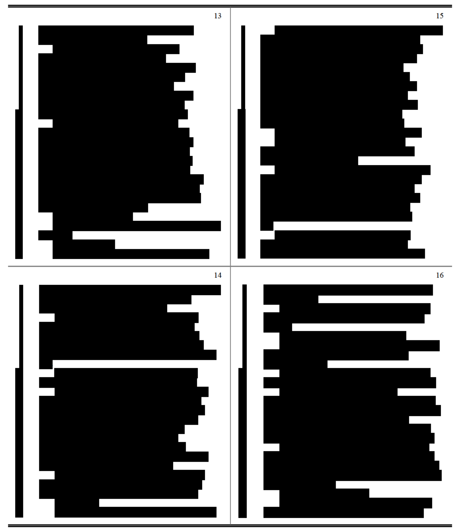
4 (Pages 13 to 16)