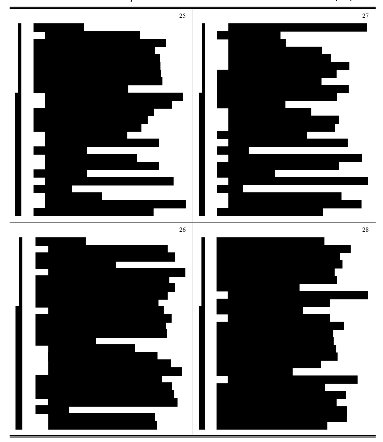
7 (Pages 25 to 28)