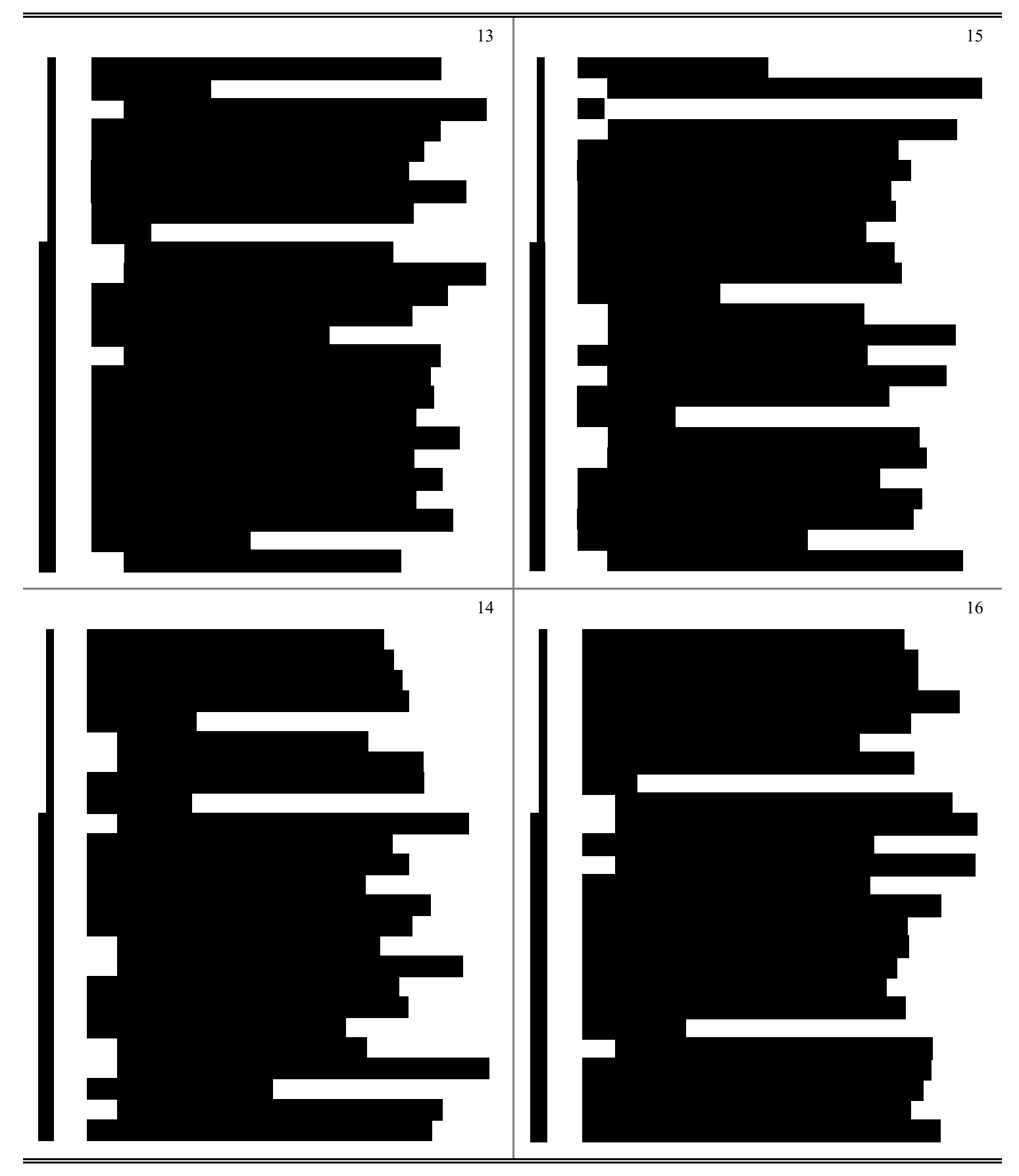
4 (Pages 13 to 16)