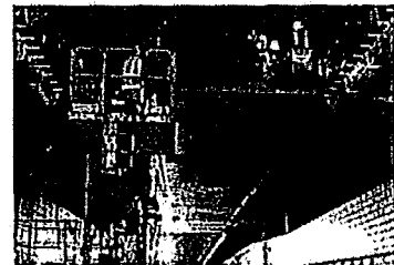
Crime scene investigators examine the bolt hanger system above concrete ceiling panels in a Big Dig tunnel.

In Washington state, the San Francisco company is building a nuclear waste treatment center that may end up $7 billion over its original estimate and six years late.