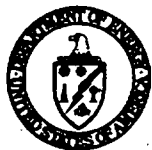
FEDERICO F. PEÑA Secretary of Energy