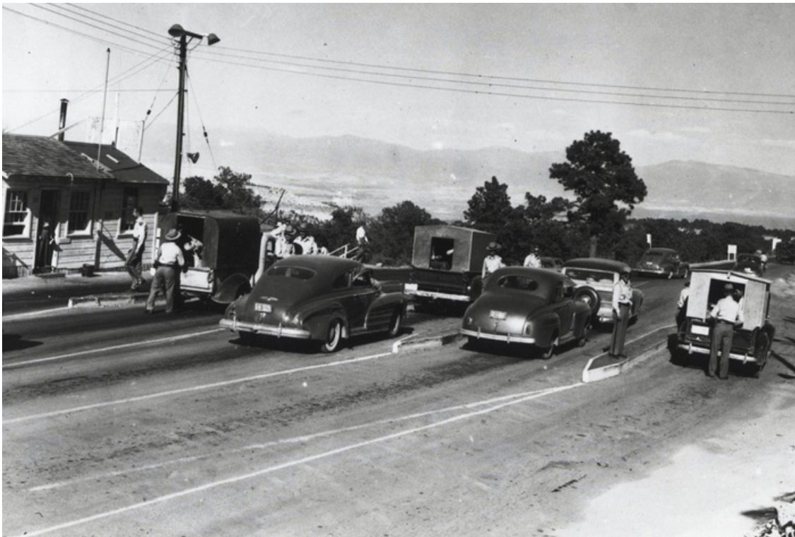
Los Alamos Main Gate, Manhattan Project