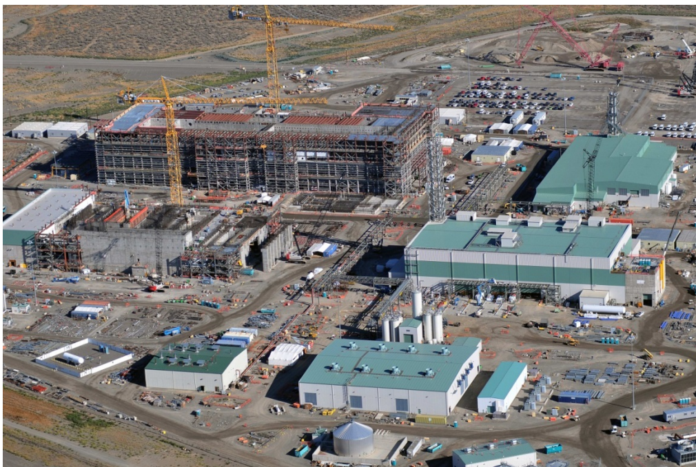
Waste Treatment and Immobilization Plant, Hanford Site

Additional information on these safety issues can be found in the Board's reports to Congress dated July 15, 2013, and December 26, 2013, available on the Board's website.