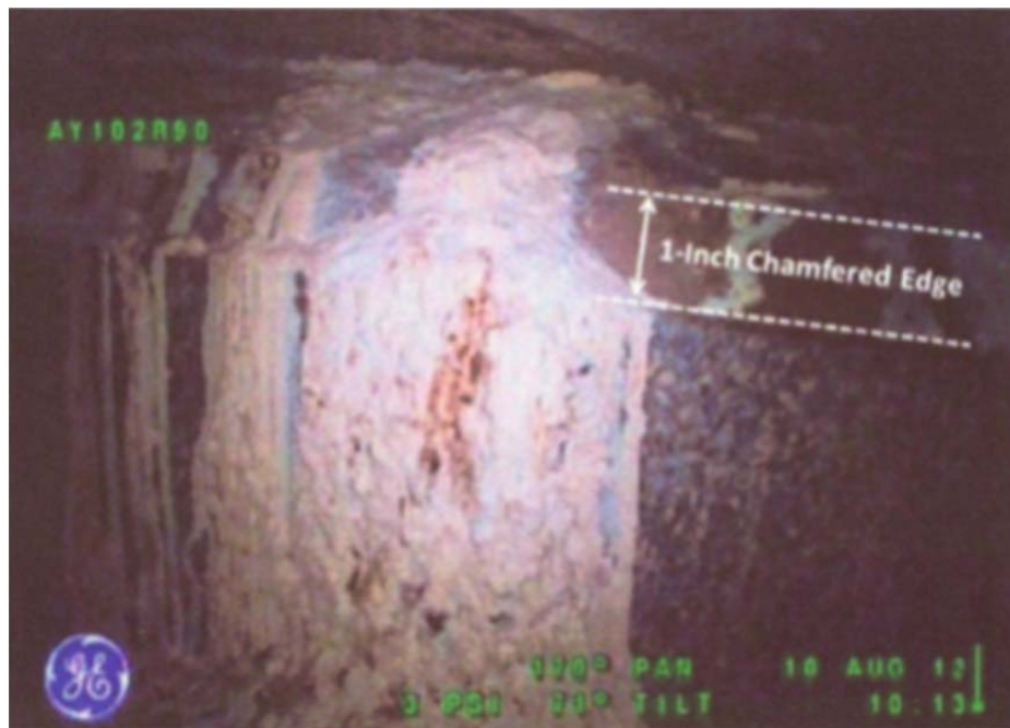
Leaked Waste in Secondary Containment of Tank AY-102

The Board advised DOE that if it chooses to retrieve some of the liquid from the tank, the tank should be closely monitored for signs of increased leakage or blockage of air channels distributing cooling air to the tank bottom. The Board also advised DOE to consider developing an improved thermal model of the tank to aid in understanding the safety significance of any changes observed after removal of liquids.