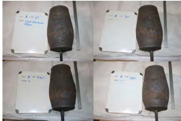
Figure 4-19. Post-test conditions of test vessel for Sequence 8. Angle positions refer to the visible portion of the vessel (see Figure 2-4). Angular positions, in clockwise direction, starting from upper left quadrant: 0°, 90°, 180°, and 270°.

pressures at lower temperatures but suggested that the impact on ARF would be counteracted by less container bulging at the lower temperatures, given that SRNS used a correlation that relates ARF to both failure pressure and container volume (see Figure A-5 for photographs of bulging). This hypothesis would also have to be confirmed by additional testing.