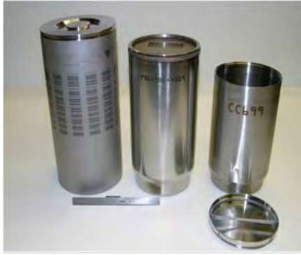
Figure A-1. EPD container configuration, example from SRS. From left to right, these are the outer, inner, and convenience containers.

The second container set included an outer container manufactured by Dynamic Flowform, Inc. (Flowform). The manufacturing process plastically deforms a metal blank around a mandrel to achieve the final container dimensions. The process forms the container base and walls from the same metal blank. The inner container in this container set is the type used in LANL's advanced recovery and integrated extraction system. The convenience container is a crimped lid canister. Figure A-2 shows this configuration.