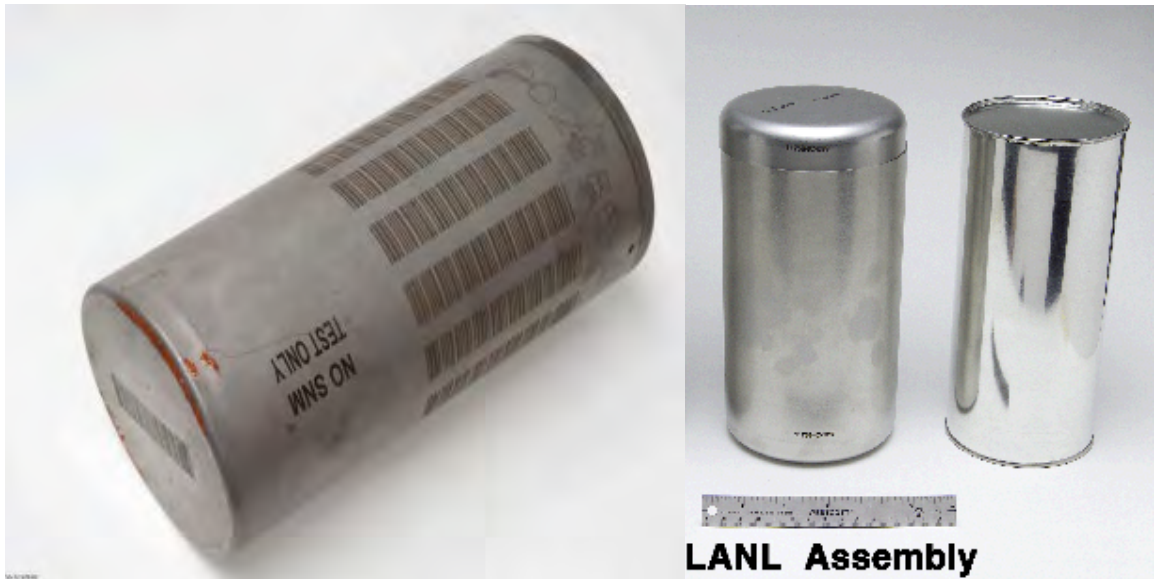
Figure A-2. Flowform container configuration, example from LANL. From left to right, these are the outer, inner, and convenience containers.

The second container set included an outer container manufactured by Dynamic Flowform, Inc. (Flowform). The manufacturing process plastically deforms a metal blank around a mandrel to achieve the final container dimensions. The process forms the container base and walls from the same metal blank. The inner container in this container set is the type used in LANL's advanced recovery and integrated extraction system. The convenience container is a crimped lid canister. Figure A-2 shows this configuration.